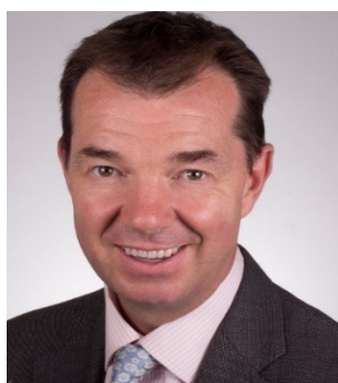
Guy Opperman MP

I support the report’s conclusions that there should be an agreed baseline workforce reporting framework. This initiative could go a long way in improving data, transparency and providing investors with a better assessment of how companies are performing on workforce issues. As well as the steps that companies must take, I encourage investors to read this report and use their influence and stewardship tools at their disposal – including engagement and voting – to probe and challenge investee companies about how they look after and engage with their workforce.