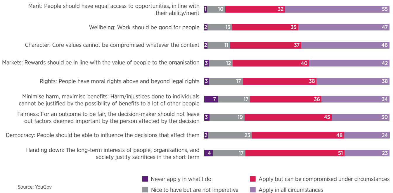
Figure 2: Application of principles by practitioners (%)

This is in contrast with what the practitioners think is the ‘right’ thing to do when asked about good professional practice, as opposed to their current practice. For instance, in balancing the interests of the business and its people, the respondents recognise individuals as legitimate stakeholders in the work